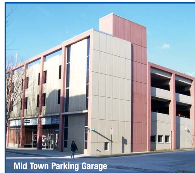
Mid Town Parking Garage

Tickets can be paid online at www.ParkWilliamsport.com with a credit card.