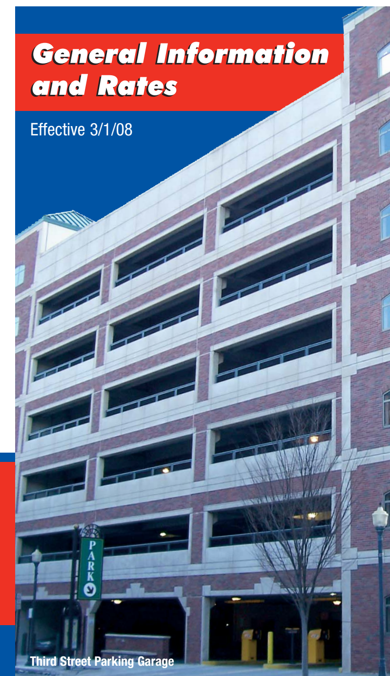
Third Street Parking Garage